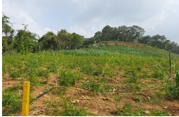
Afforestation on the Eastern side of Lease Buffer zone.