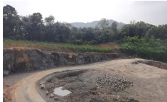
Afforestation on the Southern side of Lease Buffer Zone