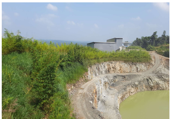
Afforestation on the Western side of Lease Buffer Zone